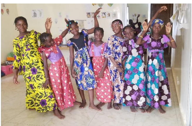
If you would like to participate in this ministry, we welcome your prayers, and your donations to <a href="mailto:ejewels.org">ejewels.org</a>.