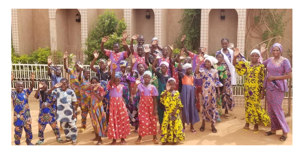
Our Sunday best!

The children have returned to Joseph's Place for 6 weeks of school, which started on June 1<sup>st.</sup> The government has opened the schools to make up for the 2-month school closing due to coronavirus. We were happy to see everyone return and quickly get back into the routine of school.